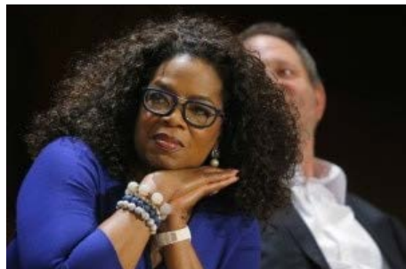
An interview with Oprah Winfrey: 'I come as one, but I stand as 10,000.'