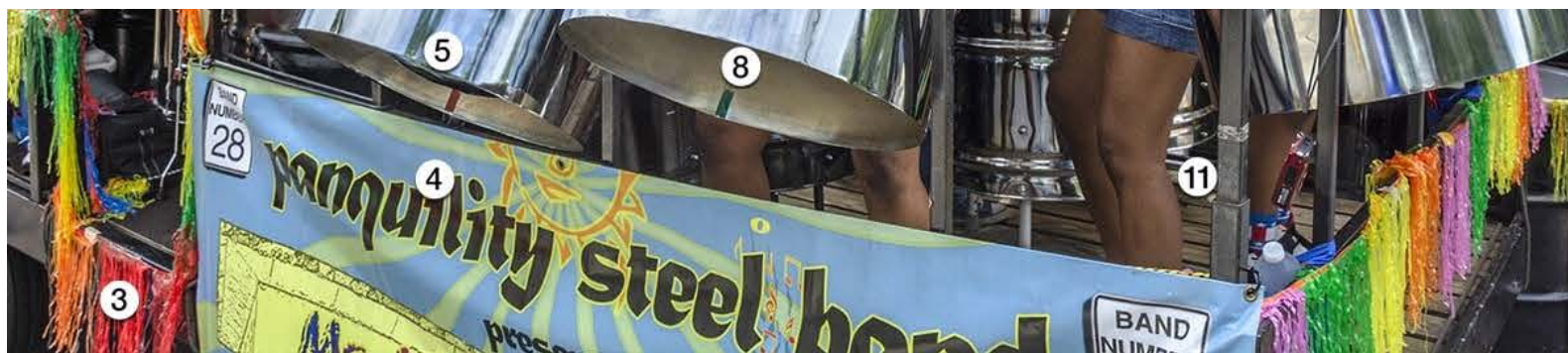
performers at the Takoma Park Independence Day Parade, 2014. July 19