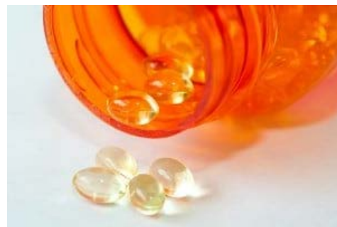
Vitamin D may help cut down asthma attacks