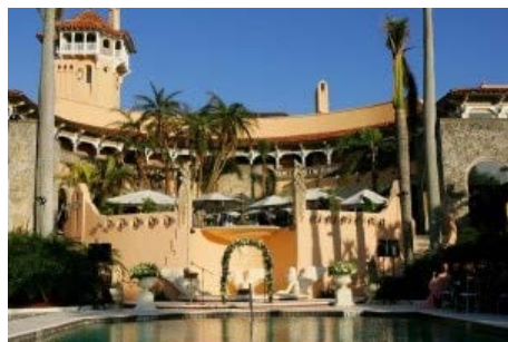
Inside Trump's Palm Beach castle and his 30-year fight to win over the locals