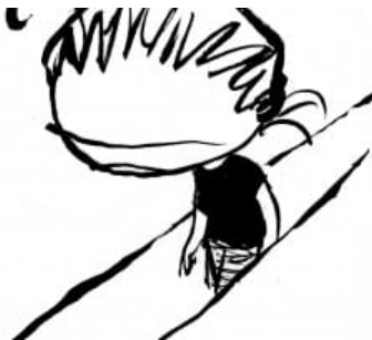
How to fight loneliness? Seek a community. Don't wait for a phone call.