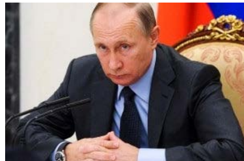
Putin goes full Orwell