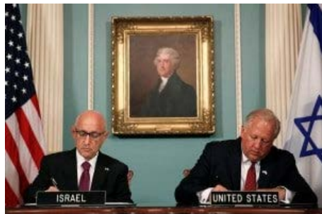
Israel, U.S. sign massive military aid package, in low-key ceremony at the State Department